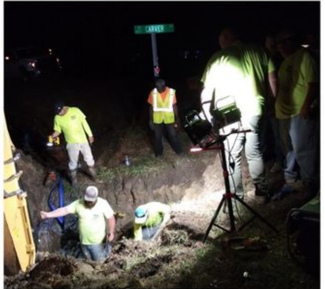
12/18/21 Water line repair at Carver Drive & NC 133