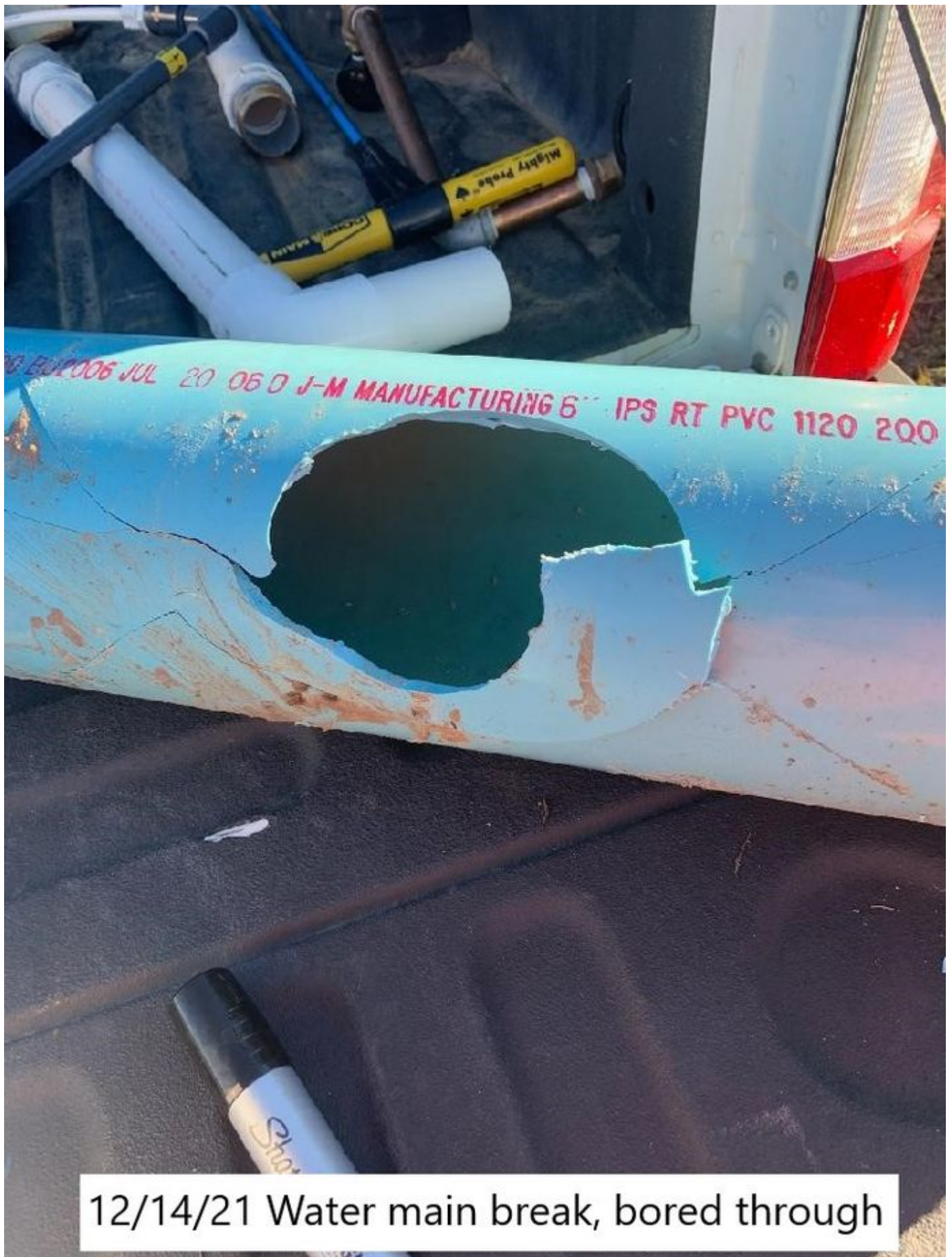
12/14/21 Water main break, bored through