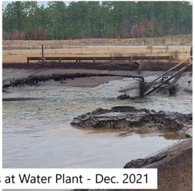
Sludge removal operations at Water Plant - Dec. 2021