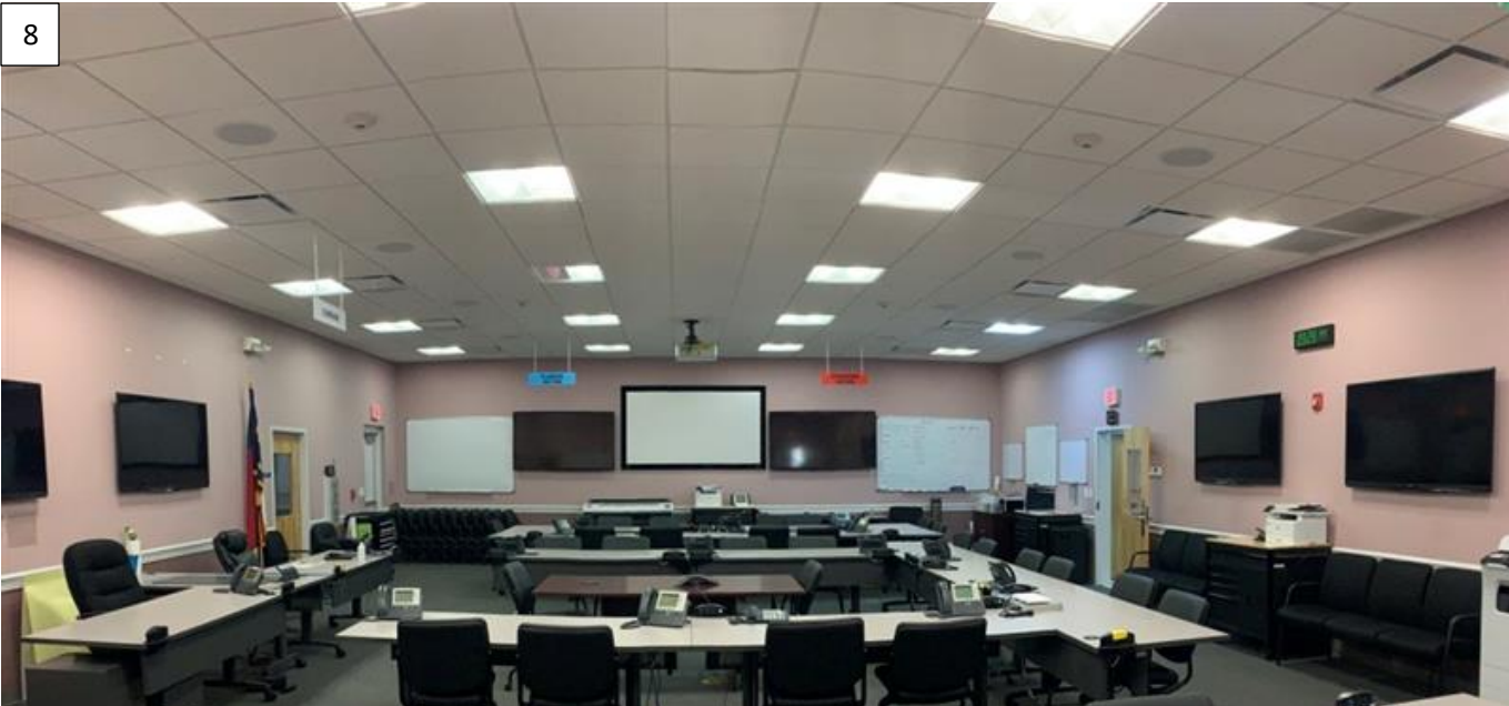
Addendum 1 is being issued for clarification, to answer questions on the RFP and to provide additional EOC photos.