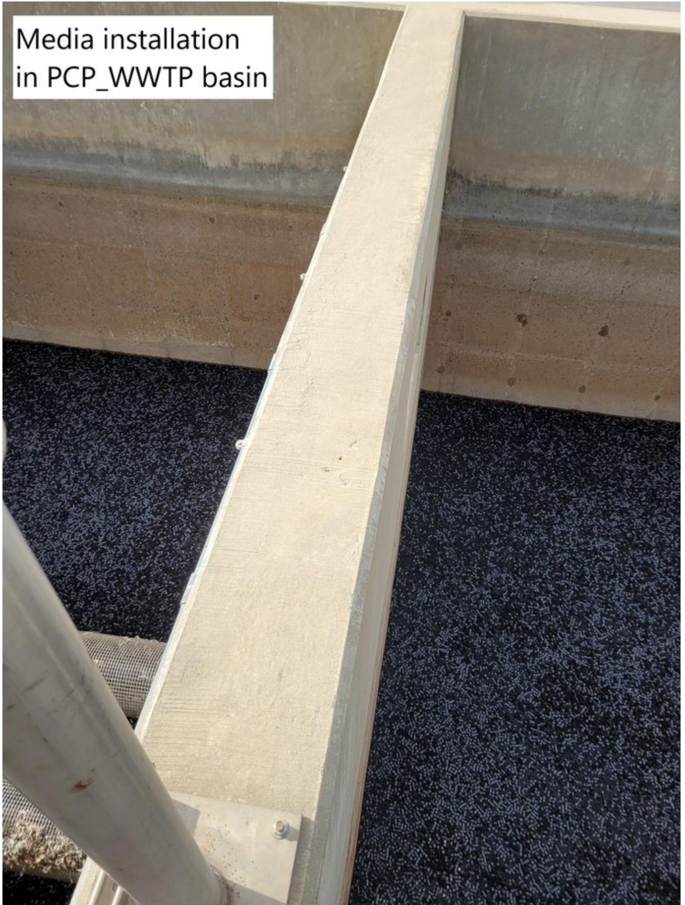
Media installation in PCP_WWTP basin