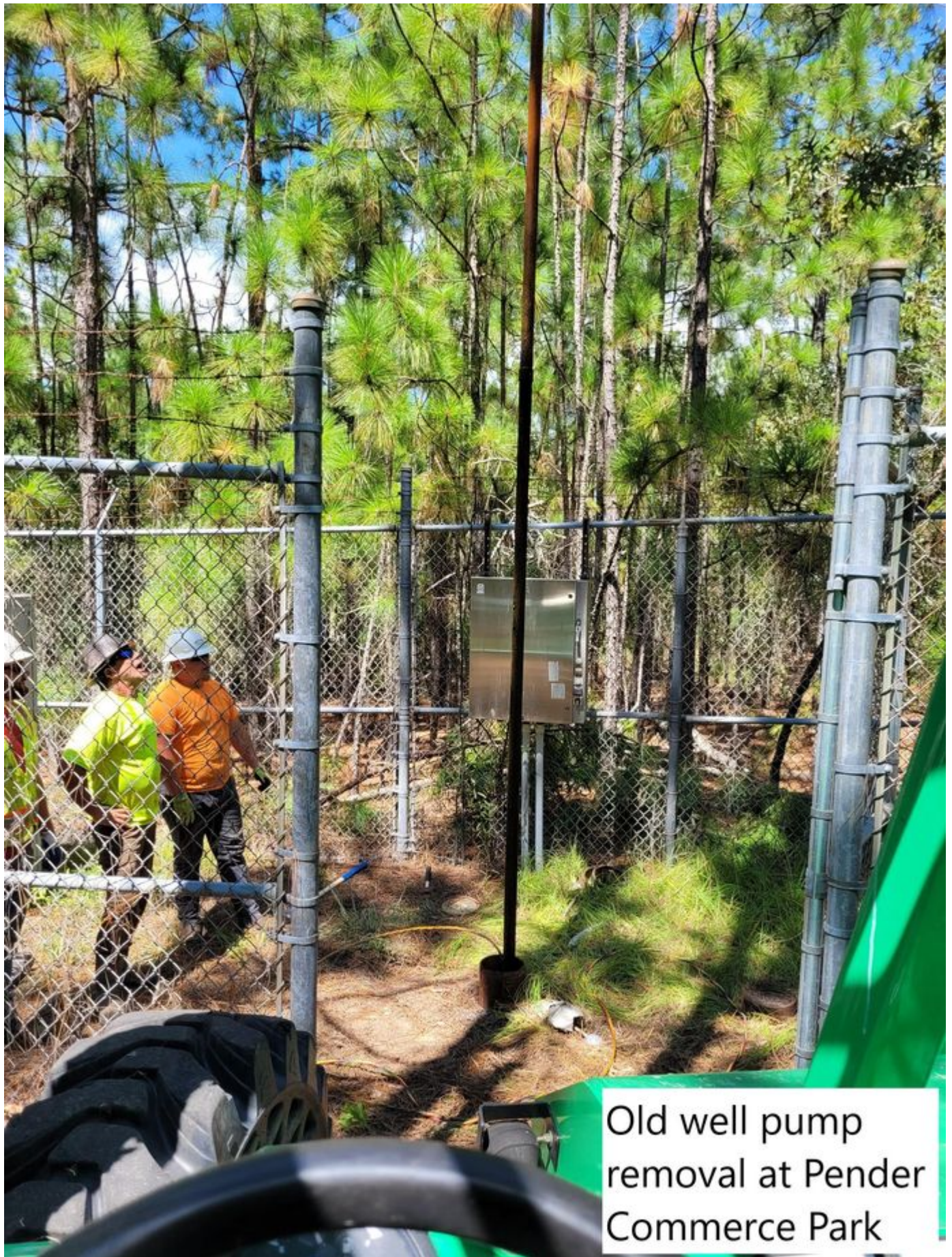
Old well pump removal at Pender Commerce Park