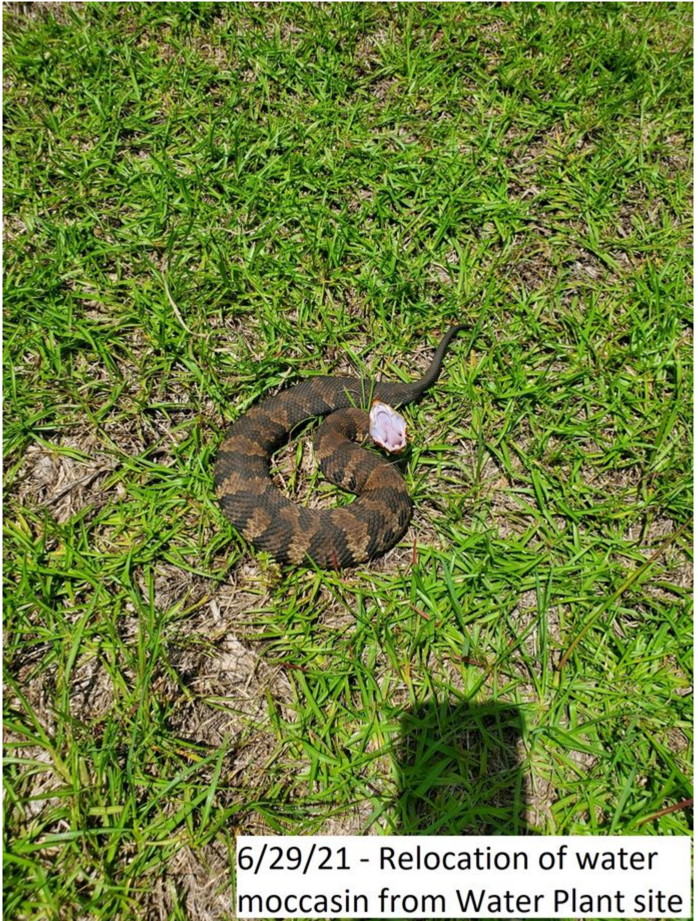
6/29/21 - Relocation of water moccasin from Water Plant site