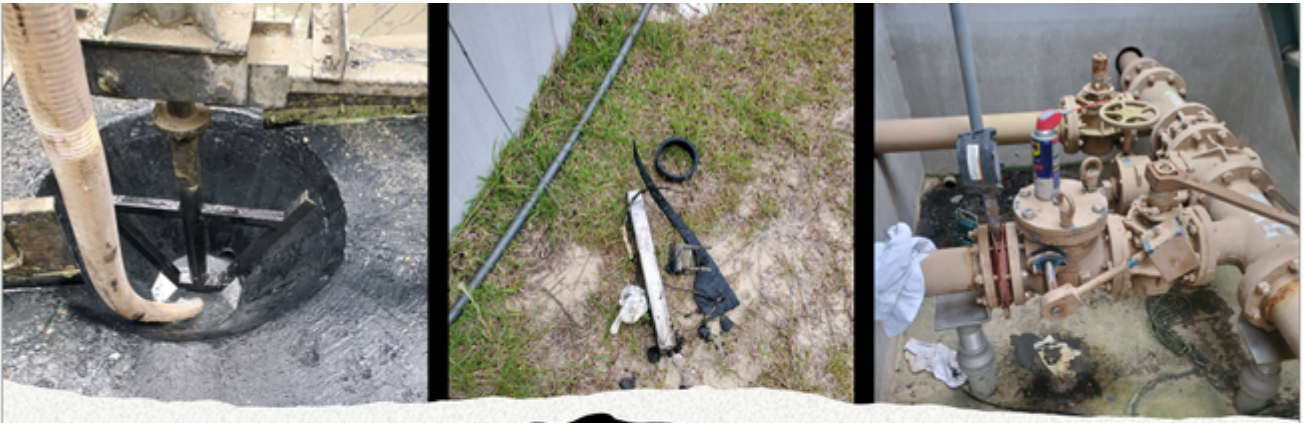
Debris removed from the clarifier and maintenance done at the Wastewater Treatment Plant Check Valve