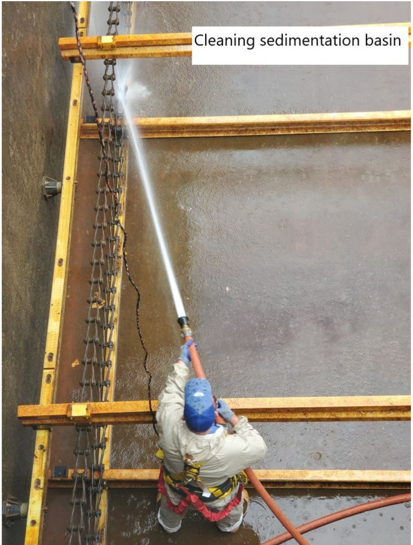
Cleaning sedimentation basin