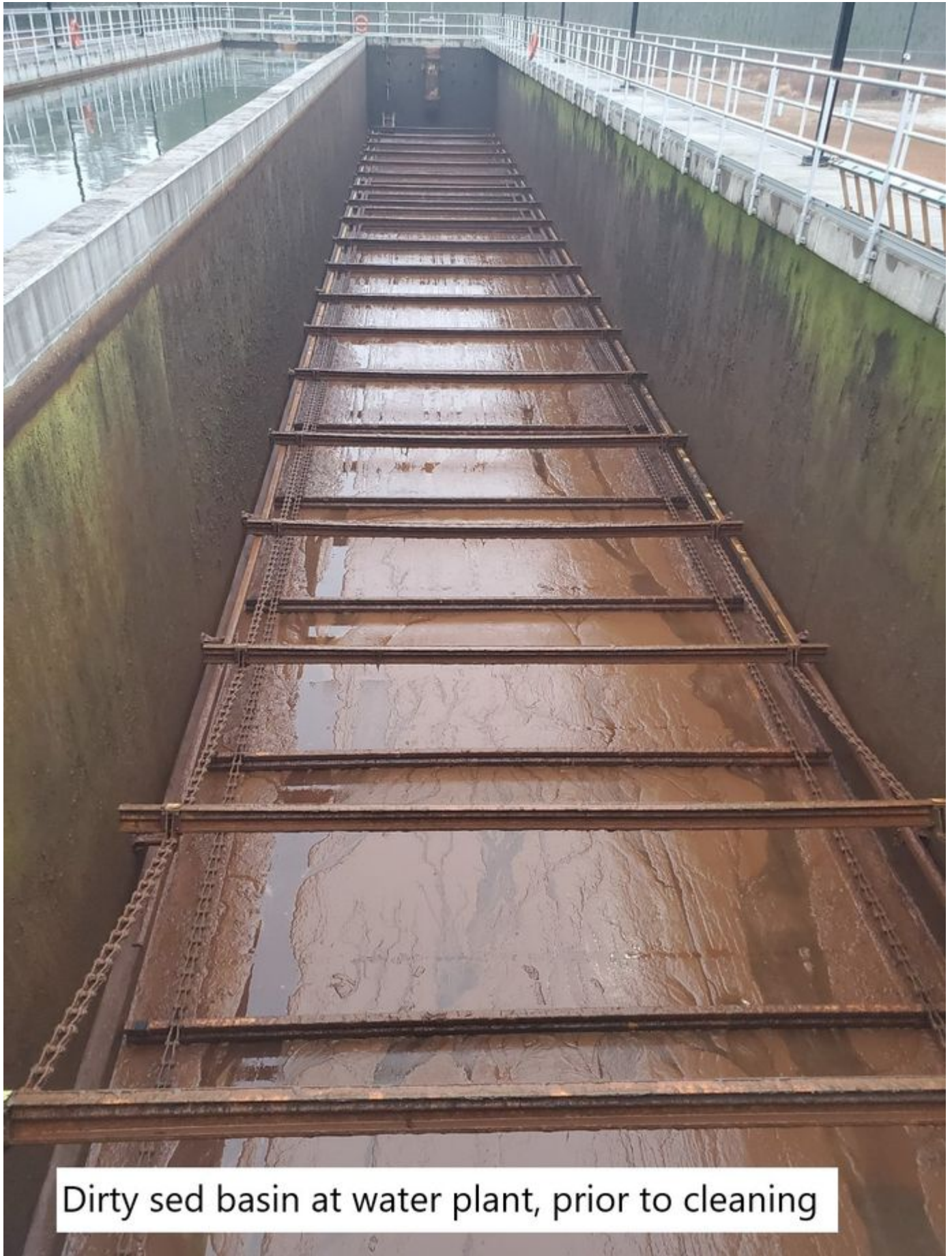
Dirty sed basin at water plant, prior to cleaning