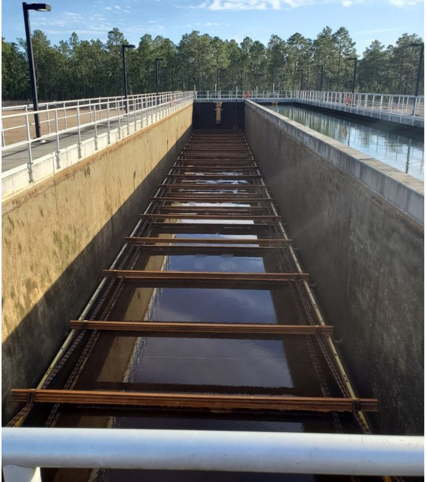
Sed basin at water plant, post-cleaning